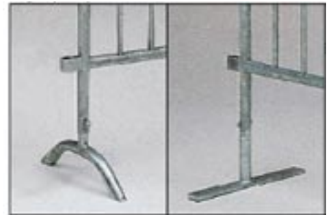
Bridge Legs Model 843-BB